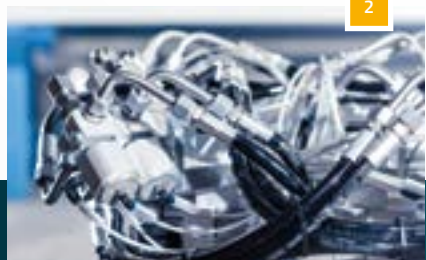
Optimal painting results